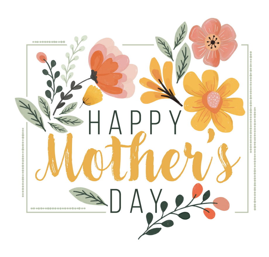
May 11<sup>th</sup>, 2025